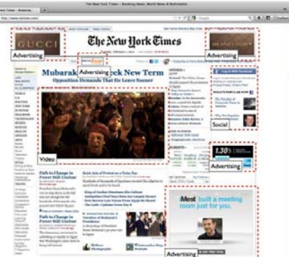
Figure 1. Third-party advertising, social, and video content on the New York Times website. Analytics content is not visible.

Second, web measurement is fast. Many claims about specific tracking practices can be supported or rebutted with mere hours of web measurement work.<sup>4</sup>